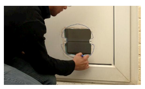
Mark out a circle approximately 2cm inside the traced line to cut your hole, leaving the indentations for your screw holes to remain the same.

Using the SureFlap mounting adaptor as a guide trace around the circumference of the circular mounting adaptor.